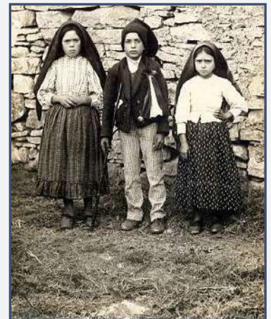
The Three Little Children of the Famous Fatima Apparitions.

The second of these elements involves the practical order, the value of devotion to the Immaculate Heart for the individual life and for the future of the human race. To this element are connected the various spiritual practices encouraged by the Angel and by the Lady, as well as the prophetic content of the message, upon which the fate of the world depends. Without the first element, the dogmatic, the practical dimension of the message of Fatima would be entirely arbitrary.